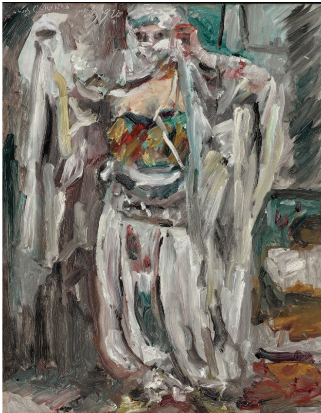
Lovis Corinth (1858 Tapaü - 1925 Zandvoort)