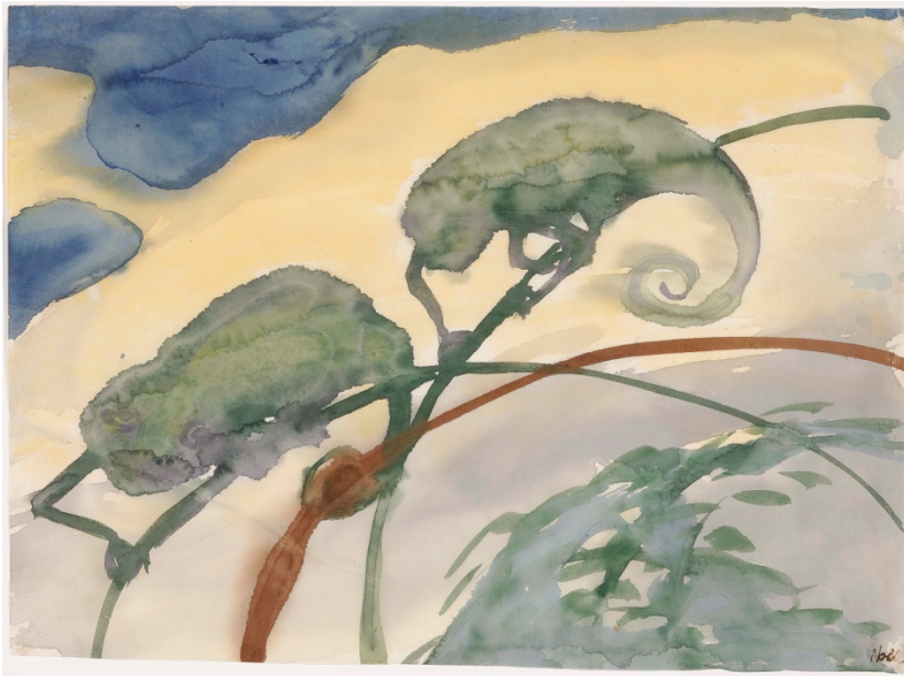
Emil Nolde (Hans Emil Hansen) (1867 Nolde /Nordschleswig - 1956 Seebüll)

The work has been documented by the Ernst Ludwig Kirchner archive in Wächtrach/Bern.