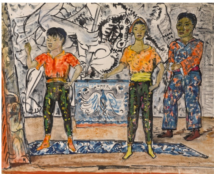
Erich Heckel (1883 Döbeln - 1970 Radolfzell/Bodensee)