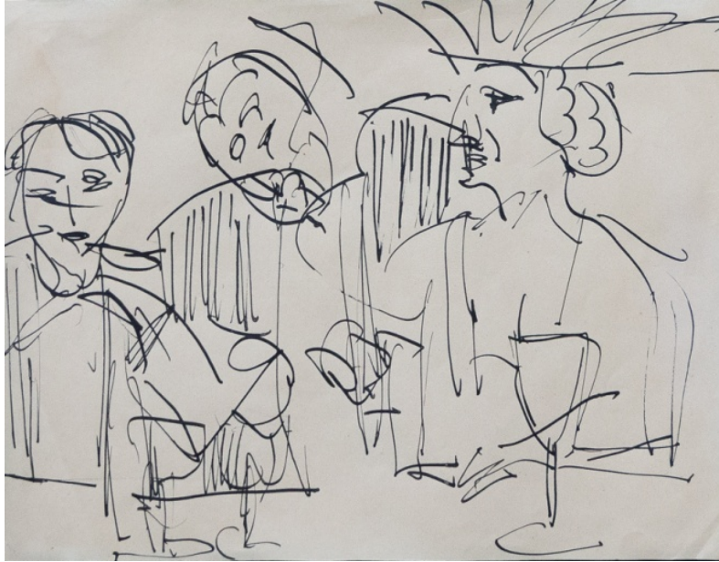
Ernst Ludwig Kirchner (1880 Aschaffenburg - 1938 Davos)