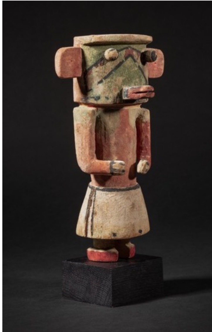
Eagle or Red-Hawk Falcon Kwahu / Palakwayo Katsina doll

8 rue des Beaux-Arts, 75006 Paris T: +33 1 46 33 77 77 – contact@galerieflak.com www.galerieflak.com