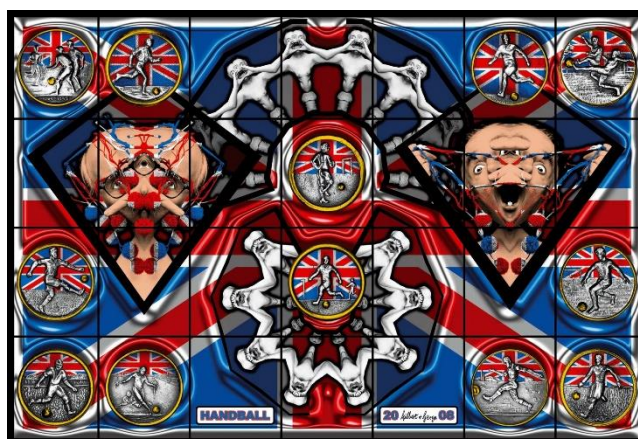
HANDBALL, 2008, 302 x 444 cm

The 'JACK FREAK PICTURES' are among the most iconic, philosophically astute and visually violent pictures that Gilbert & George have ever created." The dominant pictorial element is the Union Jack, itself an internationally familiar, abstract, geometric pattern and a socially and politically charged symbol whose significance spans the cultural spectrum from contemporary fashion to aggressive national pride. Equally prominent, and linking the 'JACK FREAK PICTURES' to almost every picture previously created by the artists, are Gilbert & George themselves in a variety of guises: dancing, gurning, howling, watching, waiting. Sometimes their bodies seem complete; other times they have been fragmented or contorted. Invariably they feature as both subject and object, artwork and artist; they are players in the epic and complex pictorial drama they have created.