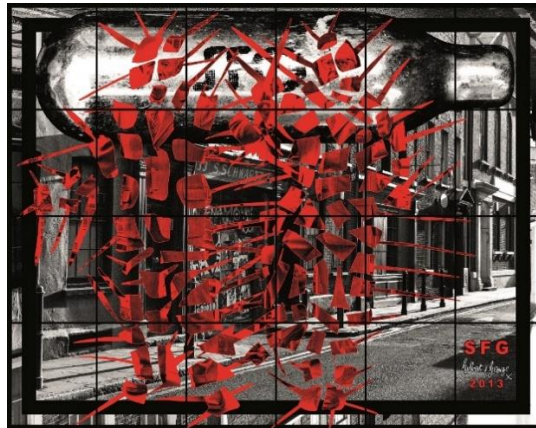
SFG, 2013, 302 x 381 cm

Echoing the maxim of the great Victorian architect, A.W.N. Pugin, 'Not a Style, but a Principle', the vision of the 'SCAPEGOATING PICTURES' both affirms and intensifies the historically iconic art of Gilbert & George, in its tireless, emotional and profound engagement with the viewer and the modern world.