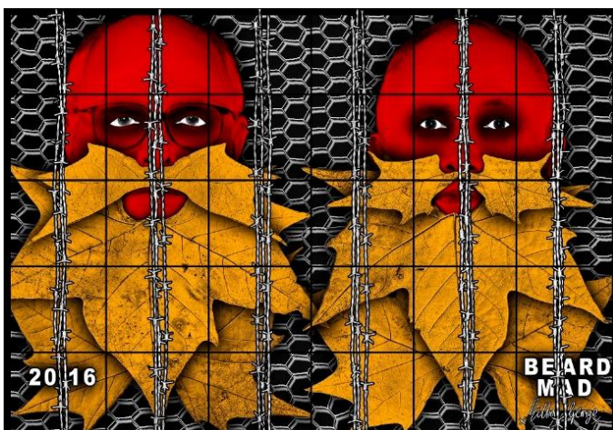
BEARD MAD, 2016, 317 x 452 cm