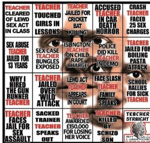
TEACHER STRAIGHT, 2011, 302 x 317 cm