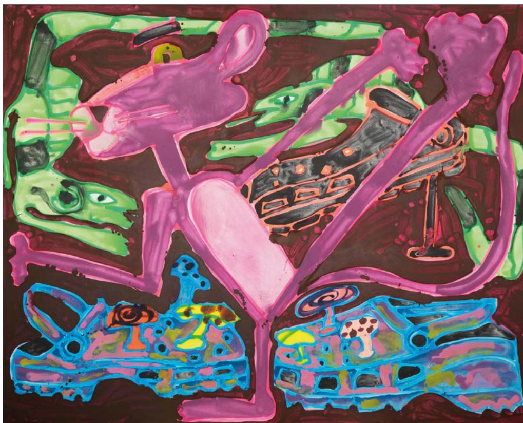
2. Panther Crocs Iguanas , 2021, Katherine Bernhardt (b. 1947), oil on canvas, 243.8 x 304.8cm. David Zwirner, London

The dealer-led event kicks off its 25th anniversary with an extra summer edition, featuring a programme of exhibitions, tours and talks.