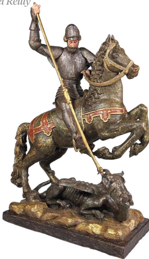
1. Saint George Killing the Dragon , late 16th century, Spain, painted wood, ht 135cm. Chiale Fine Art at BRAFA

Despite its position in this summer's packed calendar, the Belgian art fair is confident in its unique offering, writes Samuel Reilly